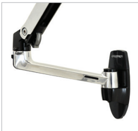
LX Extension (#45-289-026) increases reach by 9" (23 cm)