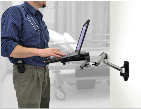
Attach a laptop to an LX Wall Mount Arm with a Notebook Tray accessory (#50-193-200)