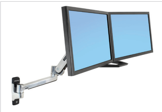
Dual Monitor & Handle Kit (#97-983) is the perfect dual-mounting solution for monitors 17" to 24"; the handle makes it easy to reposition screens