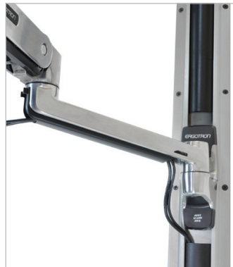
Recommended: Attach Wall Mount Arm to an Ergotron Wall Track using bracket (#97-091)