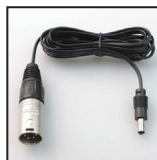
XLR 1000 Use with a standard 4 pin XLR camera battery power source.