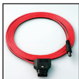
P-TAP 1000 Use with a standard battery P-TAP power source.

The kit INCLUDES AC power supply. The power adapters below are optional.